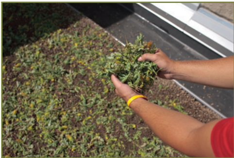
Hydro Planting with Vegetative Cuttings