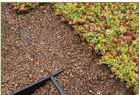
Pre-Vegetated Tiles grown inside SkyScape trays

Cover Image: SkyScape Pre-Vegetated Tiles with SkyPaver™ Composite Roof Pavers, a decorative option to complement the SkyScape Vegetative Roofing System.